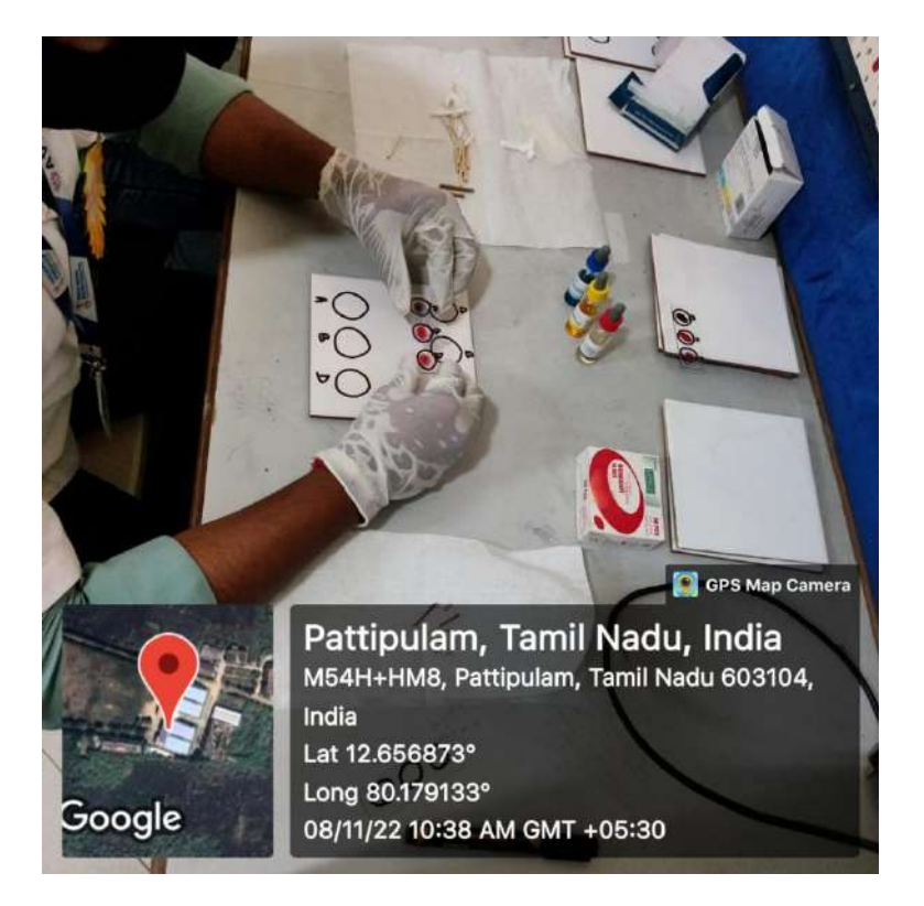
Fig 2 : Blood group testing